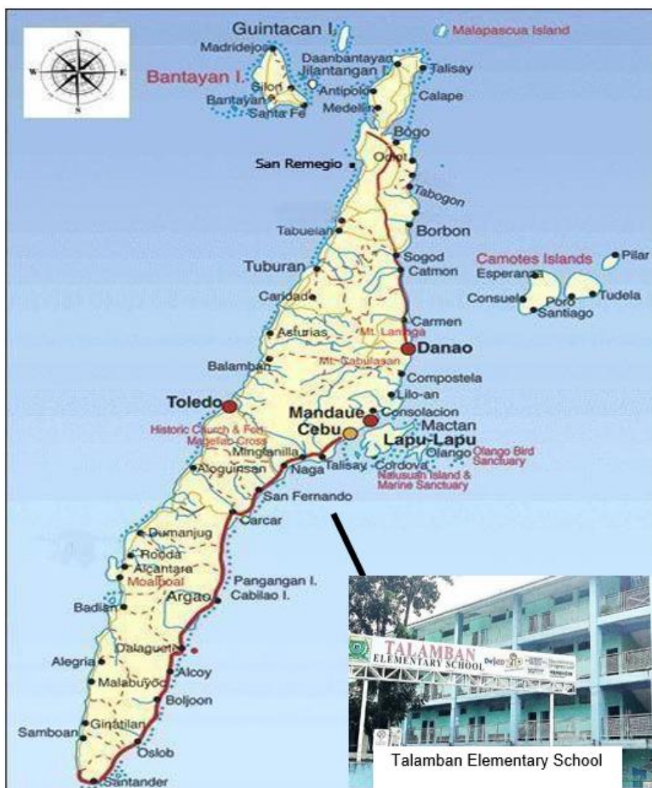
Figure 3. Location Map of the Research Environment

Located on Borbajo St., Talamban, Cebu City, Talamban Elementary School was chosen for its rich history and continuous development in providing quality education for all students. The school has demonstrated significant growth, both in student population and in the implementation of diverse educational programs, including Special Education (SPED) and Alternative Learning System (ALS). It serves as a model institution within the division, fostering an inclusive environment for children from various backgrounds and academic needs.